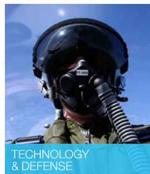
TECHNOLOGY & DEFENSE

Bankers in the Regions Restaurant Group leverage their industry expertise on behalf of national brand franchisees, franchisors, restaurant operating companies and private equity groups with a retail and consumer focus. Our team offers a thorough understanding of market conditions and provides the guidance and solutions necessary to execute growth and strategic plans.