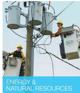
ENERGY & NATURAL RESOURCES

The Regions Healthcare team is a recognized leader in small and mid-cap healthcare, tax-exempt hospital finance and medical office building project finance. Our seasoned group of bankers has significant depth of experience providing healthcare companies with advice on capital structure, risk management and capital markets accessibility.