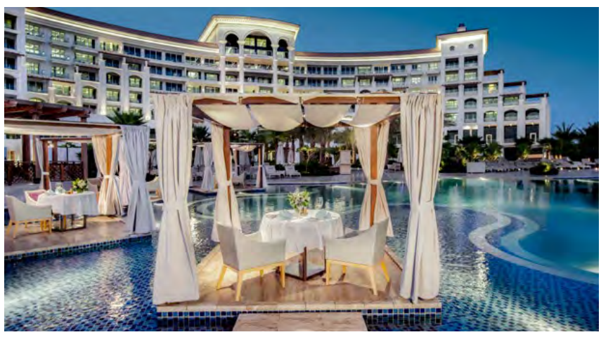
Waldorf Astoria Dubai Palm Jumeirah