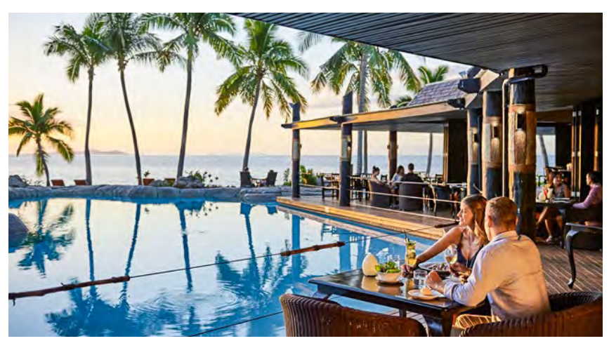
DoubleTree Resort by Hilton Fiji - Sonaisali Island